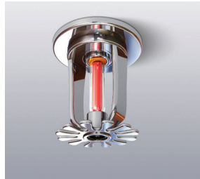
Fire Sprinkler System