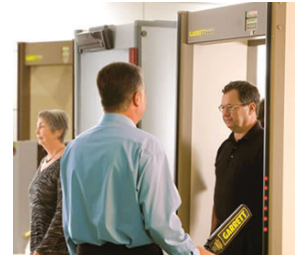
Walk Through Gates